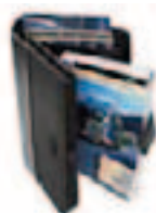
MANUALS & PRODUCT INFORMATION