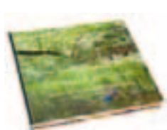
BOOKS & CATALOGUES