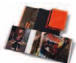
INFORMATION & MARKETING MATERIAL

Elanders handles customers' information and printed matter logistics via a single contact, no matter how voluminous the material nor how many languages it is published in. We create solutions based on our customers' needs and ability. No matter how the information is delivered to Elanders we process it and then produce and distribute it, directly to the recipient of the information when that is an advantage. We provide technical support for our customers' information management through a platform of systems that help to automate customers' information processes.