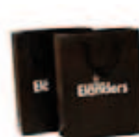
POINT OF SALES